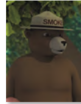
DVD featuring A Day in the Forest with Smokey Bear .