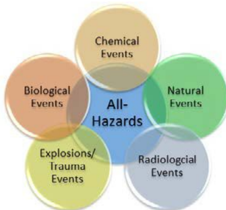
Figure 1: All-hazards approach maximizes available resources.

Peoples' Health Protected—Public Health Secured