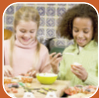
When preparing food