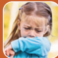
When you or someone around you is ill