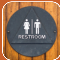
After using the restroom