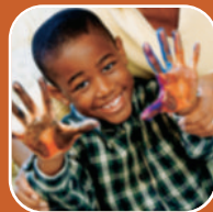
When hands are dirty