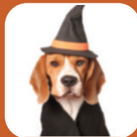
After touching animals