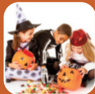
Before snack and meals