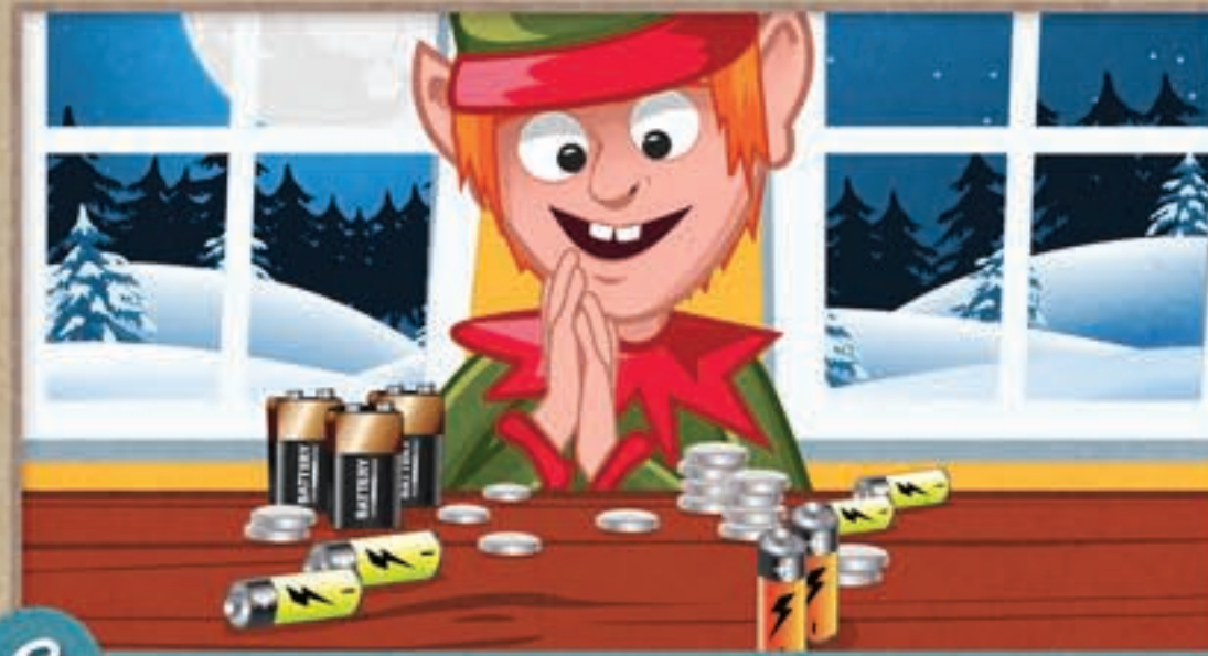
3 Keep batteries safely stored in their packaging; they can be deadly if swallowed.