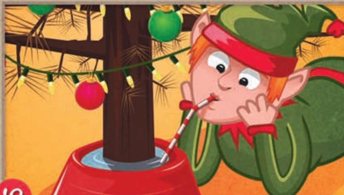
12 Keep your natural Christmas tree hydrated and water it daily.