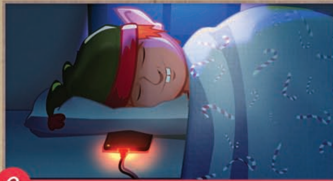
2 Never sleep with electronics under your pillow.