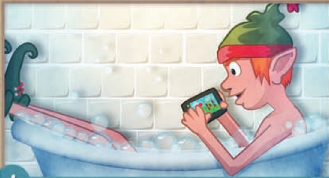
1 Do not use electronics near water.