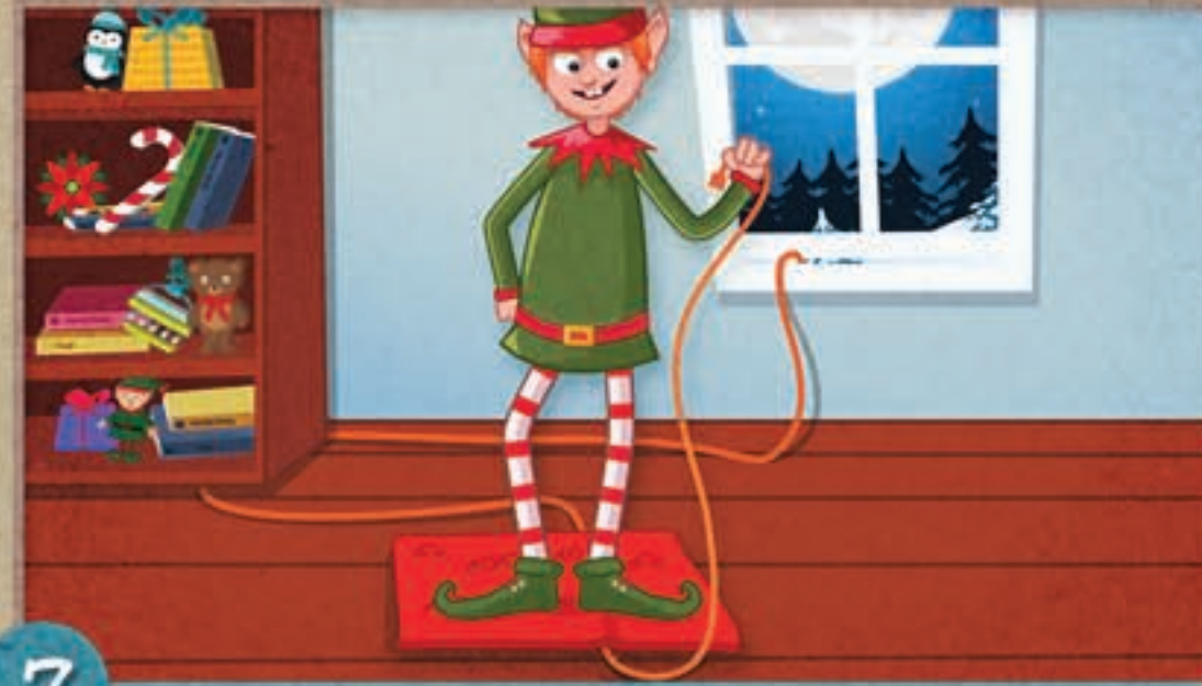
7 Do not run cords under carpets, rugs, furniture, or out of windows.