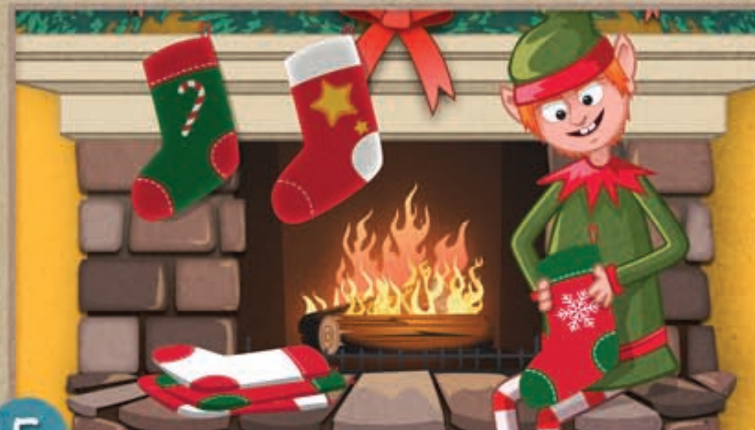
5 Keep decorations at least 3 feet away from any open flame.