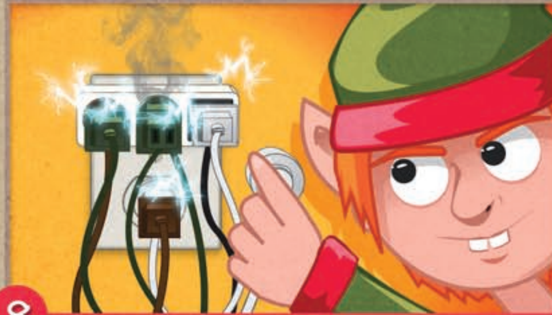
8 Do not overload outlets.