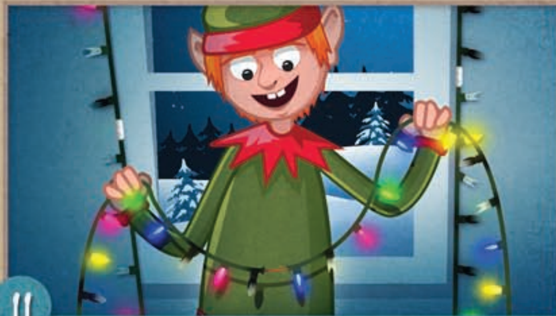
11 Inspect all decorations and discard any that are damaged or worn.