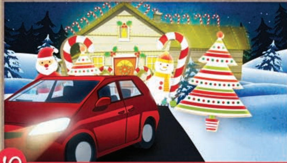
10 Always turn off decorations when you're sleeping or leaving your home.