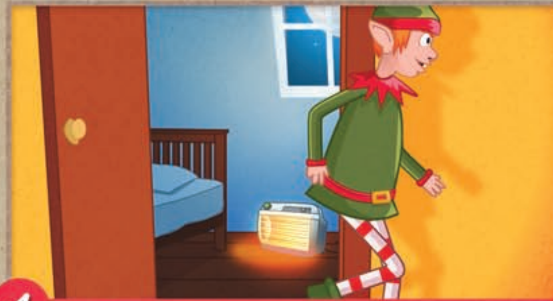
4 Do not leave space heaters unattended when in use.