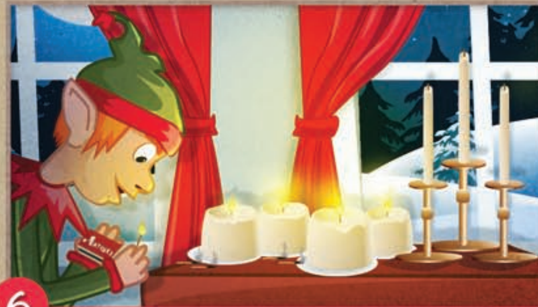
6 Never play with fire.