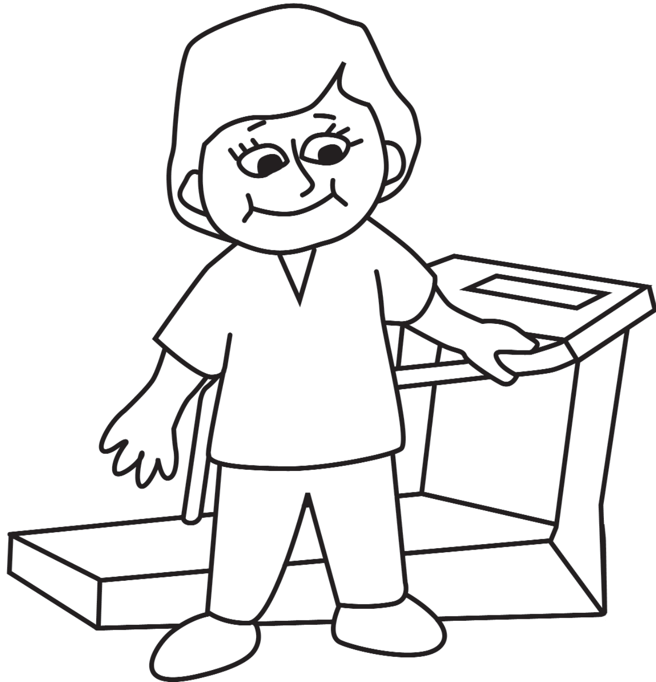
A Physical Therapist assists with exercises.