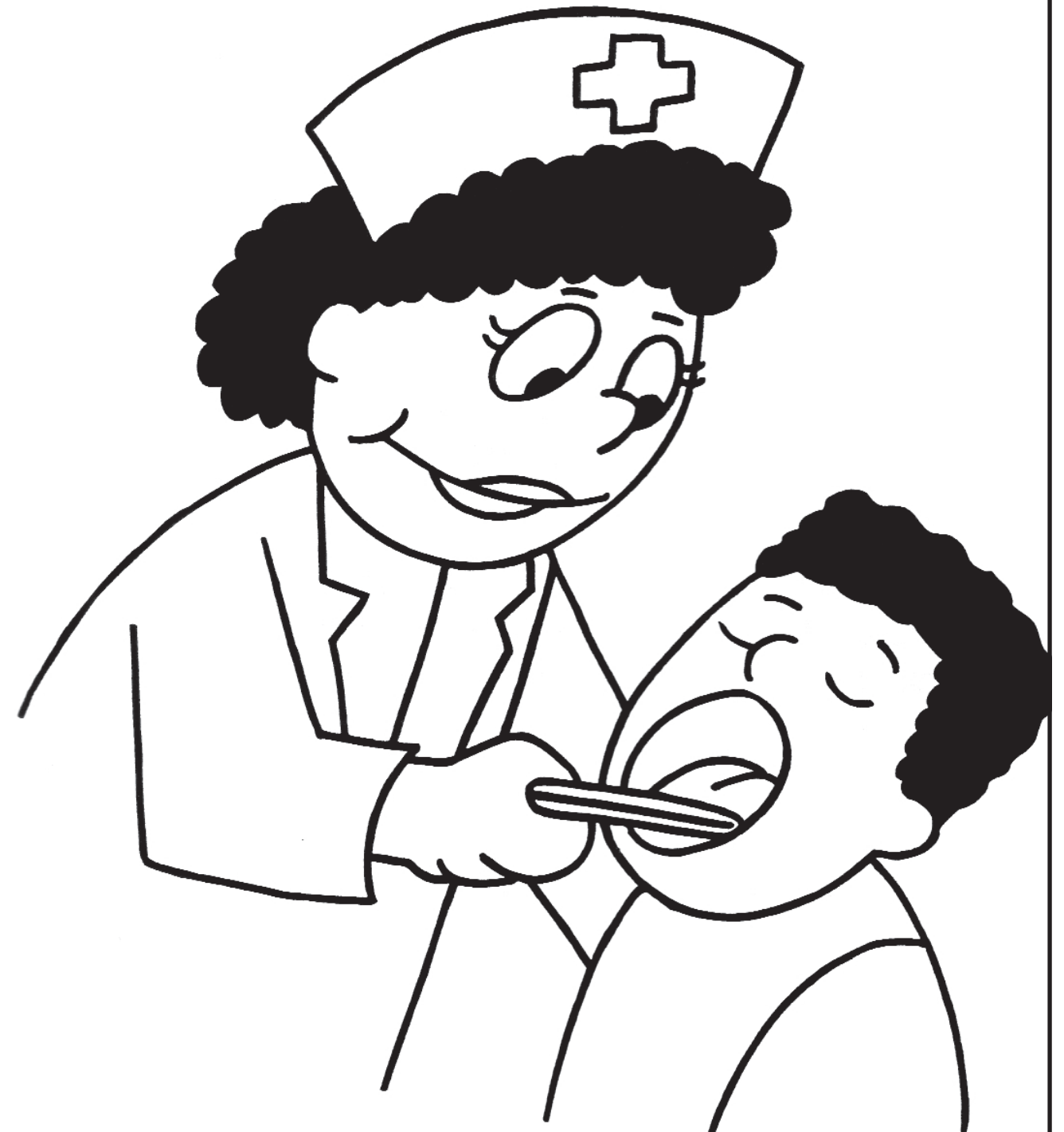
A Nurse provides health care attention.

oklahoma health care force center www.okhealthcareers.com