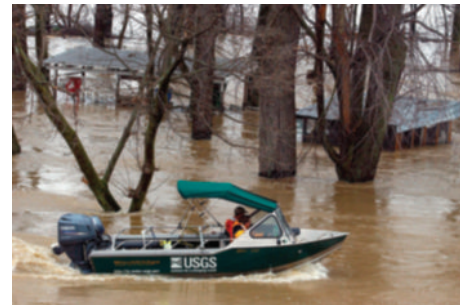
During flooding, USGS hydrographers prepare to make a streamflow measurement at the White River at Petersburg, In., Tuesday, January 11, 2005.

The USGS helps the public, policy-makers, and the emergency management community make informed decisions on how to prepare for and react to flood hazards and reduce losses from future floods.