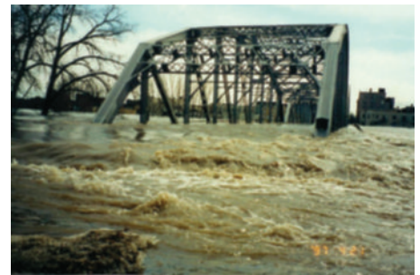
At the Sorlie Bridge between Grand Forks, N. Dak., and East Grand Forks, Minn., floodwaters from the Red River of the North crest at 54.35 feet, Tuesday, April 22, 1997. This depth was more than 24 feet above flood stage and more than 4 feet above the previous record.