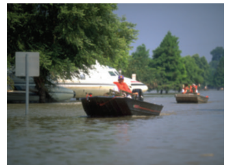
During the 1993 Midwest floods, boaters pass an airport in Chesterfield, Mo., Friday, July 9, 1993.

Reduction of flood losses must be based on the best possible understanding of how and where floods happen and how they cause damage.