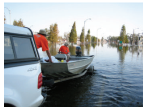
USGS biologists prepare to launch a wetlands research boat for search and rescue in New Orleans during flooding from Hurricane Katrina, Sunday, September 4, 2005.