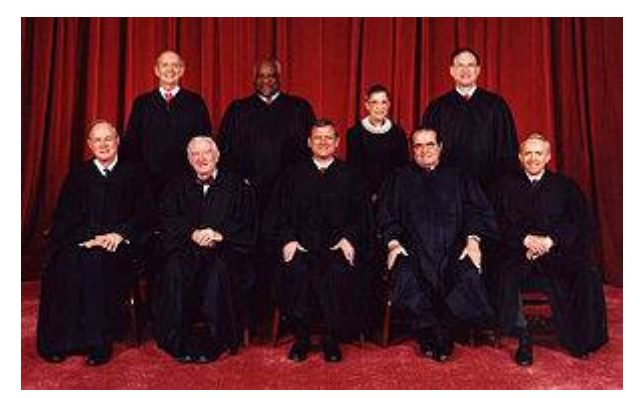
The Justices who decided Heller

part, the operative clause. The operative clause's text and history demonstrate that it connotes an individual right to keep and bear arms. pp. 2–22. [207][208]