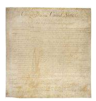
The Bill of Rights in the National Archives

The Second Amendment was based partially on the right to keep and bear arms in English common law and was influenced by the English Bill of Rights of 1689. Sir William Blackstone described this right as an auxiliary right, supporting the natural rights of self-defense and resistance to oppression, and the civic duty to act in concert in defense of the state. [11]