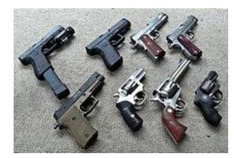
Assortment of 20th century handguns

The first, known as the "states' rights" or "collective right" model, held that the Second Amendment does not apply to individuals; rather, it recognizes the right of each state to arm its militia. Under this approach, citizens "have no right to keep or