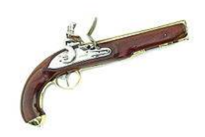
Ketland brass barrel smooth bore pistol common in Colonial America

During the first two decades following the ratification of the Second Amendment, public opposition to standing armies, among Anti-Federalists and Federalists alike, persisted and manifested itself locally as a general reluctance to create a professional armed police force, instead relying on county sheriffs, constables and night watchmen to enforce local ordinances. Though sometimes compensated, often these positions were unpaid – held as a matter of civic duty. In these early decades, law enforcement officers were rarely armed with firearms, using billy clubs as their sole defensive weapons. In serious emergencies, a posse comitatus , militia company, or group of vigilantes assumed law enforcement duties; these individuals were more likely than the local sheriff to be armed with firearms. On May 8, 1792, Congress passed In act more effectually to provide for the National Defence, by establishing an Uniform Militia throughout the United States requiring: