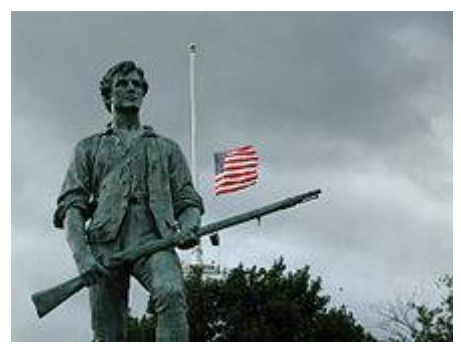
Ideals that helped to inspire the Second Amendment in part are symbolized by the minutemen.<sup>[52]</sup>

were explicitly mentioned in early state constitutions; for example, the <u>Pennsylvania Constitution of 1776</u> asserted that, "the people have a right to bear arms for the defence of themselves and the state!<sup>65</sup>]