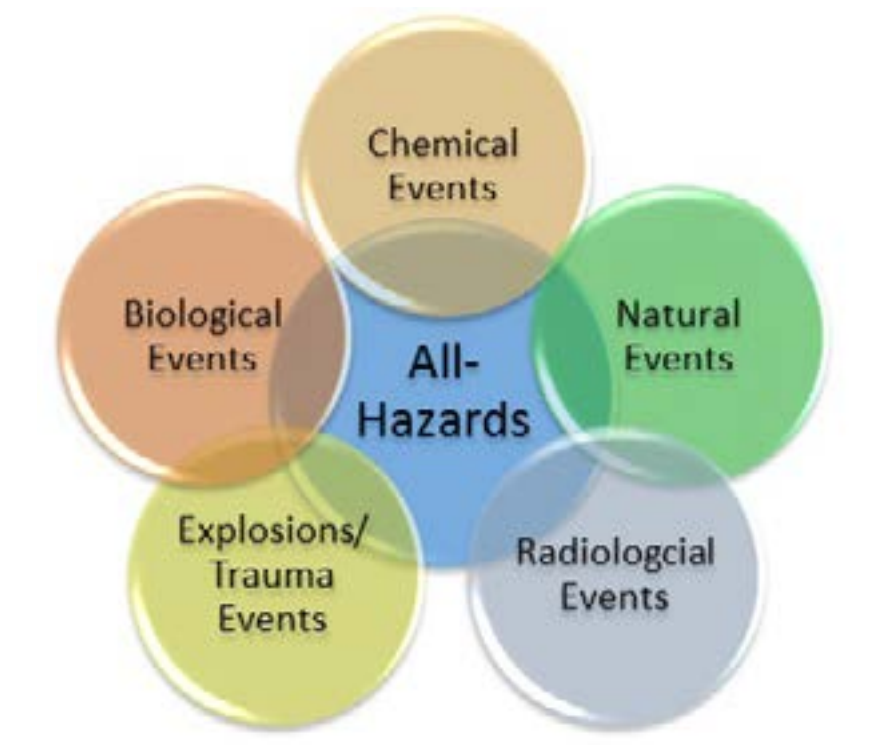
Figure 1: All-hazards approach maximizes available resources.

Peoples' Health Protected—Public Health Secured