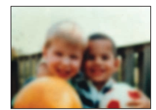
Same scene as viewed by a person with advanced cataract.