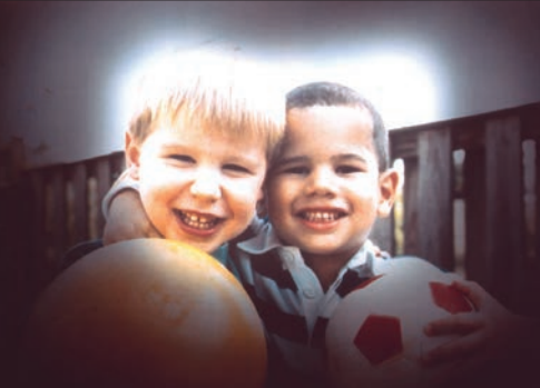
Same scene as viewed by a person with advanced glaucoma.