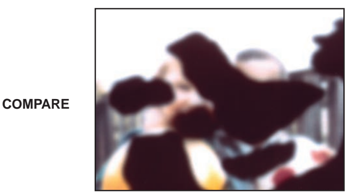
Same scene viewed by a person with advanced diabetic retinopathy.