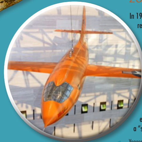
Eric Long, National Air and Space Museum

Yeager's supersonic plane hangs from the ceiling of the National Air and Space Museum.