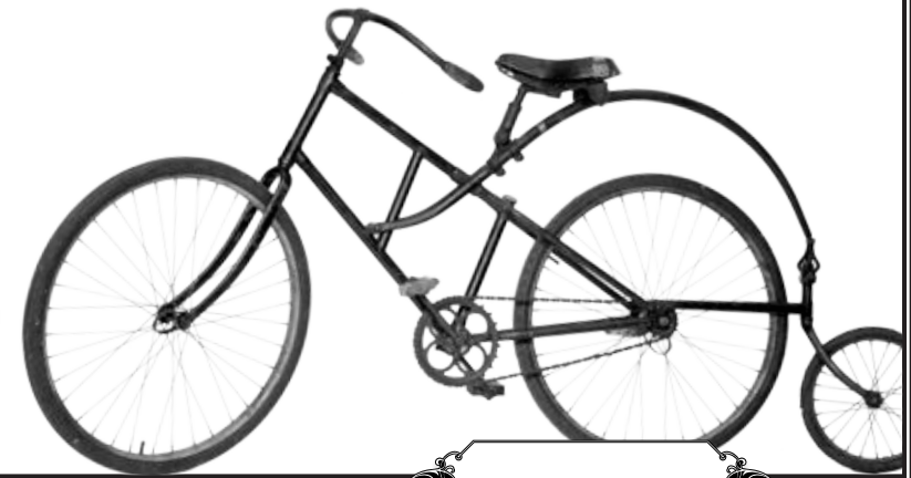
NAME / DATE