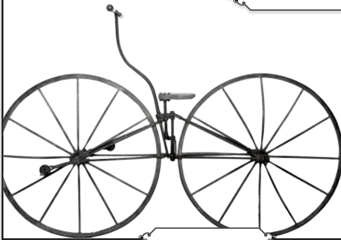
NAME / DATE