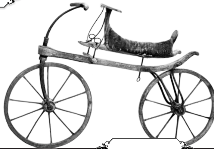
NAME / DATE