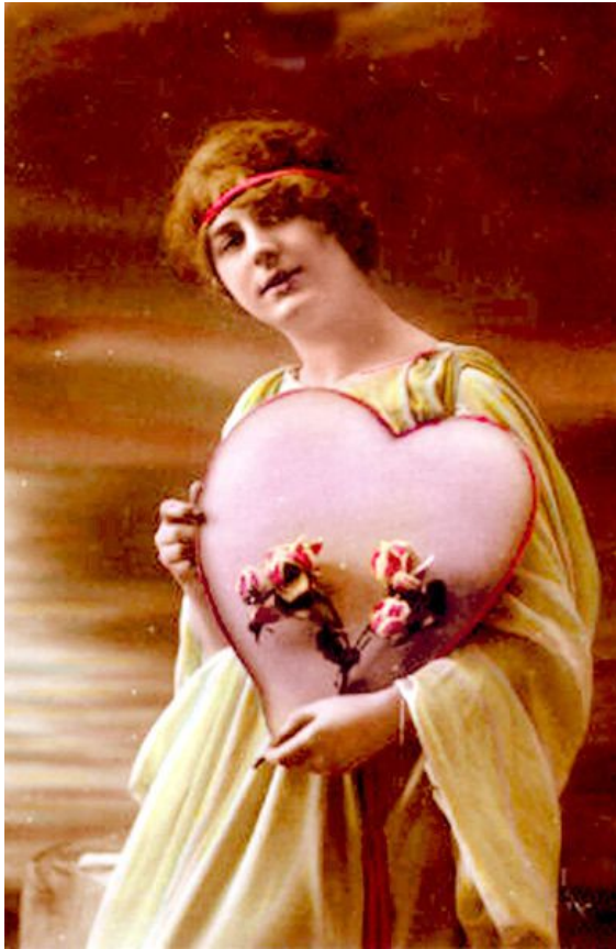
Valentine's Day postcard, circa 1910