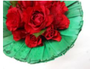
Valentine's Day red roses