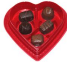
Box of Valentine chocolates

In the United States, the first mass-produced valentines of embossed paper lace were produced and sold shortly after 1847 by Esther Howland (1828–1904) of Worcester, Massachusetts.*[60]*[61] Her father operated a large book and stationery store, but Howland took her inspiration from an English Valentine she had received from a business associate of her father.*[62]*[63] Intrigued with the idea of making similar Valentines, Howland began her business by importing paper lace and floral decorations from England.*[63]*[64] A writer in Graham's American Monthly observed in 1849, "Saint Valentine's Day ... is becoming, nay it has become, a national holyday."*[65] The English practice of sending Valentine's cards was established enough to feature as a plot device in Elizabeth Gaskell's Mr. Harrison's Confessions (1851): "I burst in with my explanations: 'The valentine I know nothing about.' 'It is in your handwriting', said he coldly."*[66] Since 2001, the Greeting Card Association has been giving an annual "Esther Howland Award for a Greeting Card Visionary" .*[61]