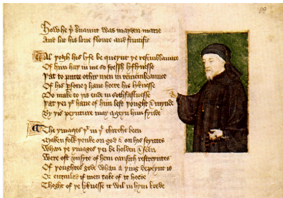
Geoffrey Chaucer by Thomas Hoccleve (1412)

Alban Butler in his Lives of the Principal Saints (1756–1759) claimed without proof that men and women in Lupercalia drew names from a jar to make couples, and that modern Valentine's letters originated from this custom. In reality, this practice originated in the Middle Ages, with no link to Lupercalia, with men drawing the names of girls at random to couple with them. This custom was combated by priests, for example by Frances de Sales around 1600, apparently by replacing it with a religious custom of girls drawing the names of apostles from the altar. However, this religious custom is recorded as soon as the 13th century in the life of Saint Elizabeth of Hungary, so it could have a different origin.*[15]