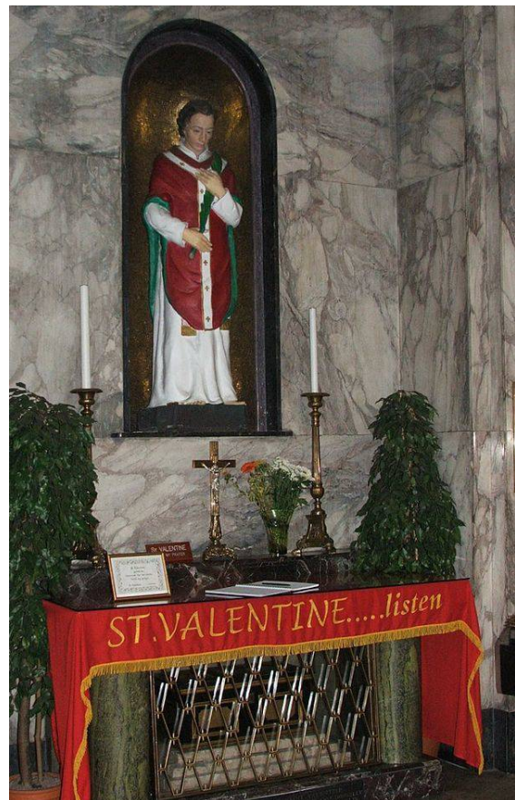
Shrine of St. Valentine in Whitefriar Street Carmelite Church in Dublin, Ireland

Numerous early Christian martyrs were named Valentine. [8] The Valentines honored on February 14 are Valentine of Rome ( Valentinus presb. m. Romae ) and Valentine of Terni ( Valentinus ep. Interamnensis m. Romae ). [9] Valentine of Rome was a priest in Rome who was martyred about AD 496 and was buried on the Via Flaminia. The relics of Saint Valentine were kept in the Church and Catacombs of San Valentino in Rome, which "remained an important pilgrim site throughout the Middle Ages until the relics of St. Valentine were transferred to the church of Santa Prassede