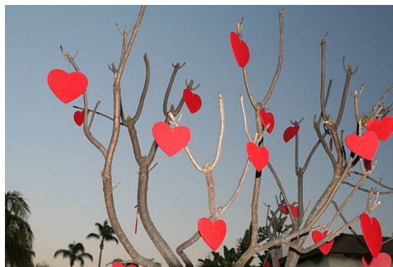
Tree in San Diego decorated with hearts on Valentine's Day

In the United States, about 190 million Valentine's Day cards are sent each year, not including the hundreds of millions of cards school children exchange.*[81] Additionally, in recent decades Valentine's Day has become increasingly commercialized and a popular gift-giving event, with Valentine's Day themed advertisements encouraging spending on loved ones. In fact, in the United States alone, the average valentine's spending has increased every year, from $108 a person in 2010 to $131 in 2013.*[69]