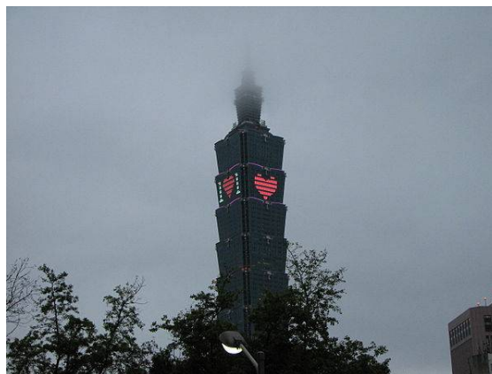
Taipei 101 in Valentine's Day 2006

In Taiwan, traditional Qixi Festival, Valentine's Day and White Day are all celebrated. However, the situation is the reverse of Japan's. Women give gifts to men on Valentine's Day, and men return them on White Day.*[99]