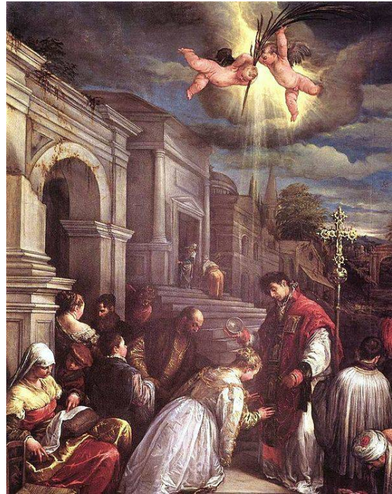
St. Valentine baptizing St. Lucilla, Jacopo Bassano