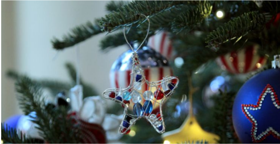
A beaded star ornament in the East Landing Room of the White House, December, 2012.

The trees in the East Landing Room are decorated with a variety of handmade beaded stars of red, white, and blue. You can make these yourself with supplies you can find at any craft store.