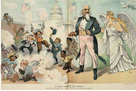
American children of many ethnic backgrounds celebrate noisily in 1902 Puck cartoon