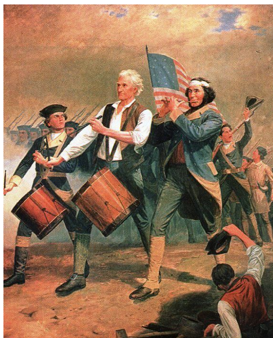
Originally entitled Yankee Doodle, this is one of several versions of a scene painted by A. M. Willard that came to be known as The Spirit of '76. Often imitated or parodied, it is a familiar symbol of American patriotism

designated “America’s Official Fourth of July City-Small Town USA” by resolution of Congress. Seward has also been proclaimed “Nebraska’s Official Fourth of July City” by Governor James Exon in proclamation. Seward is a town of 6,000 but swells to 40,000+ during the July 4 celebrations. [23]