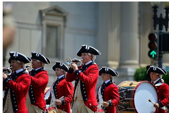
Independence Day Parade in Washington, D.C.

Independence Day fireworks are often accompanied by patriotic songs such as the national anthem "The Star-Spangled Banner", "God Bless America", "America the Beautiful", "My Country, 'Tis of Thee", "This Land Is Your Land", "Stars and Stripes Forever", and, regionally, "Yankee Doodle" in northeastern states and "Dixie" in southern states. Some of the lyrics recall images of the Revolutionary War or the War of 1812.