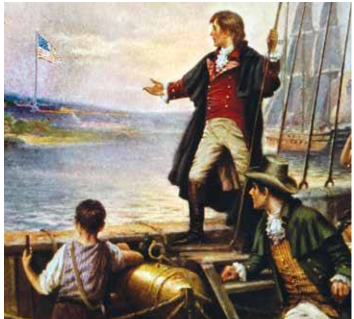
In "The Star-Spangled Banner," by Percy Moran, Francis Scott Key reaches toward the flag flying over Fort McHenry.

Many Americans celebrate national or federal holidays. These holidays often honor people or events in our American heritage. These holidays are "national" in a legal sense only for federal institutions and in the District of Columbia. Typically, federal offices are closed on these holidays. Each state can decide whether or not to celebrate the holiday. Businesses, schools, and commercial establishments may choose whether or not to close on these days. Since 1971, federal holidays are observed on Mondays except for New Year's Day, Independence Day, Veterans Day, Thanksgiving, and Christmas.