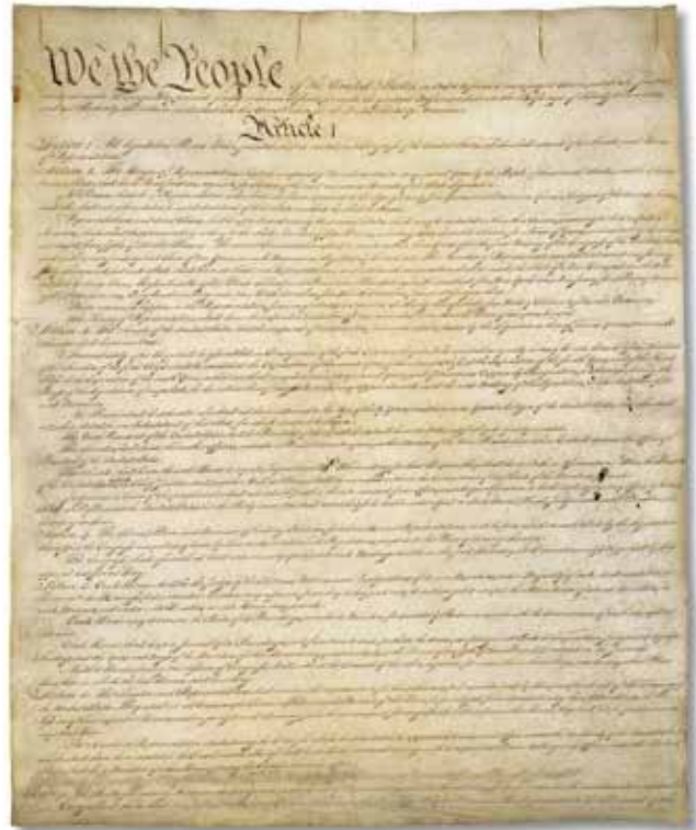
The Constitution of the United States.

The Constitution, written in 1787, created a new system of U.S. government—the same system we have today. James Madison was the main writer of the Constitution. He became the fourth president of the United States. The U.S. Constitution is short, but it defines the principles of government and the rights of citizens in the United States. The document has a preamble and seven articles. Since its adoption, the Constitution has been amended (changed) 27 times. Three-fourths of the states (9 of the original 13) were required to ratify (approve) the Constitution. Delaware was the first state to ratify the Constitution on December 7, 1787. In 1788, New Hampshire was the ninth state to ratify the Constitution. On March 4, 1789, the Constitution took effect and Congress met for the first time. George Washington was inaugurated as president the same year. By 1790, all 13 states had ratified the Constitution.