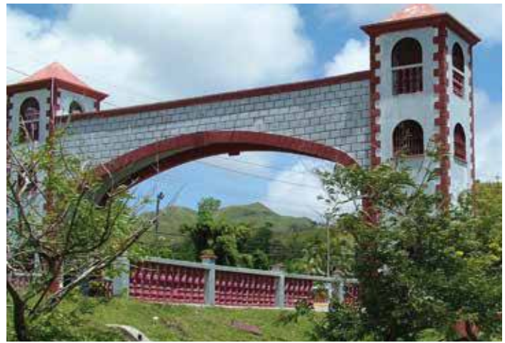
Old Spanish Bridge in Umatac, Guam.

The northern border of the United States stretches more than 5,000 miles from Maine in the East to Alaska in the West. There are 13 states on the border with Canada. The Treaty of Paris of 1783 established the official boundary between Canada and the United States after the Revolutionary War. Since that time, there have been land disputes, but they have been resolved through treaties. The International Boundary Commission, which is headed by two commissioners, one American and one Canadian, is responsible for maintaining the boundary.