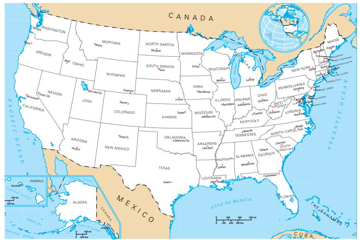
Map of the United States including state capitals.

The Constitution did not establish political parties. President George Washington specifically warned against them. But early in U.S. history, two political