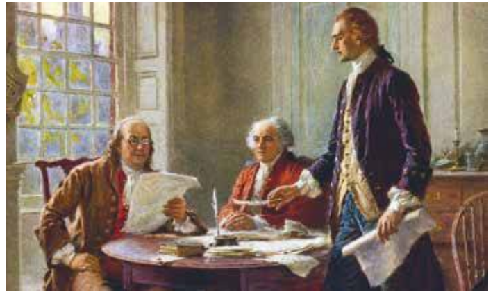
Benjamin Franklin, John Adams, and Thomas Jefferson in “Writing the Declaration of Independence, 1776,” by Jean Leon Gerome Ferris.

The Declaration of Independence lists three rights that the Founding Fathers considered to be natural and “unalienable.” They are the right to life, liberty, and the pursuit of happiness. These ideas about freedom and individual rights were the basis for declaring America’s independence. Thomas Jefferson and the other Founding Fathers believed that people are born with natural rights that no government can take away. Government exists to protect these rights. Because the people voluntarily give up power to a government, they can take that power back. The British government was not protecting the rights of the colonists, so the colonies took back their power and separated from Great Britain.