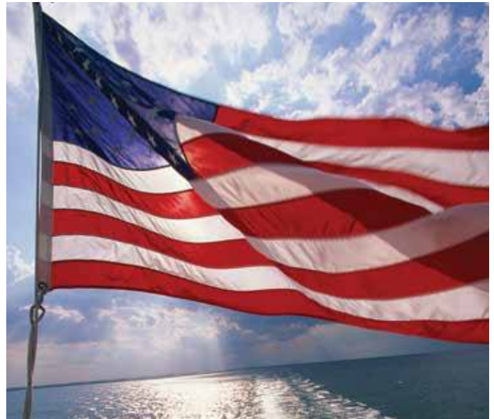
The American flag is an important symbol of the United States.

When the United States became an independent country, the Constitution gave Congress the power to establish a uniform rule of naturalization. Congress made rules about how immigrants could become citizens. Many of these requirements are still valid today, such as the requirements to live in the United States for a specific period of time, to be of good