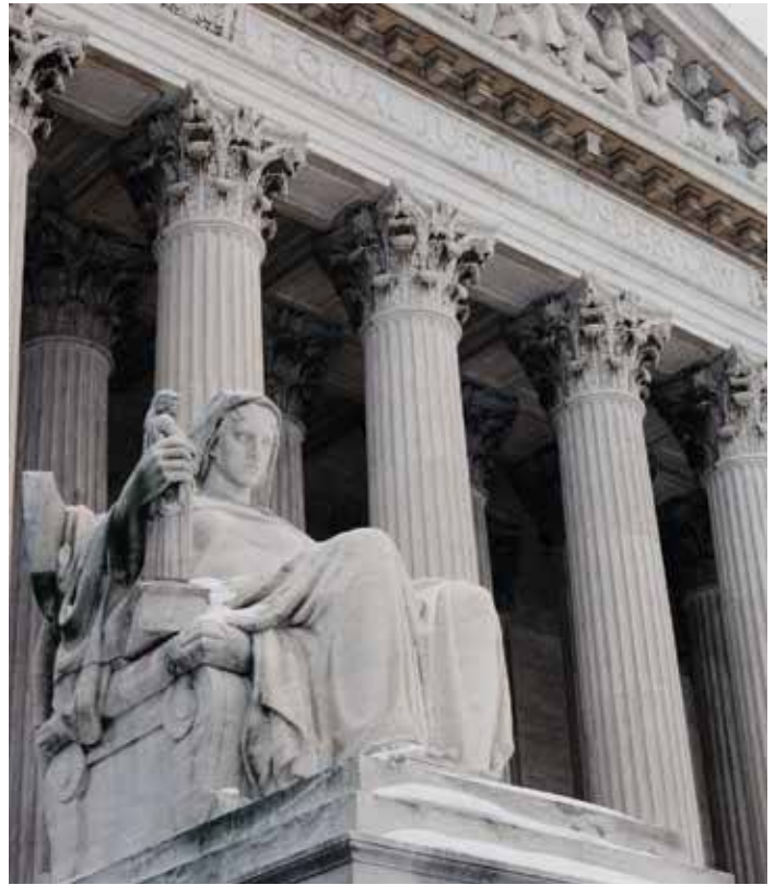
The Contemplation of Justice statue outside the U.S. Supreme Court building in Washington, D.C.

The judicial branch is one of the three branches of government. The Constitution established the judicial