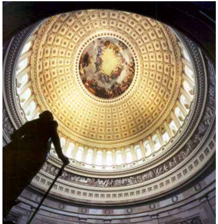
The Rotunda of the U.S. Capitol. Courtesy of the Architect of the Capitol.

Congress is divided into two parts—the Senate and the House of Representatives. Because it has two “chambers,” the U.S. Congress is known as a “bicameral” legislature. The system of checks and balances works in Congress. Specific powers are assigned to each of these chambers. For example, only the Senate has the power to reject a treaty signed by the president or a person the president chooses to serve on the Supreme Court. Only the House of Representatives has the power to introduce a bill that requires Americans to pay taxes.