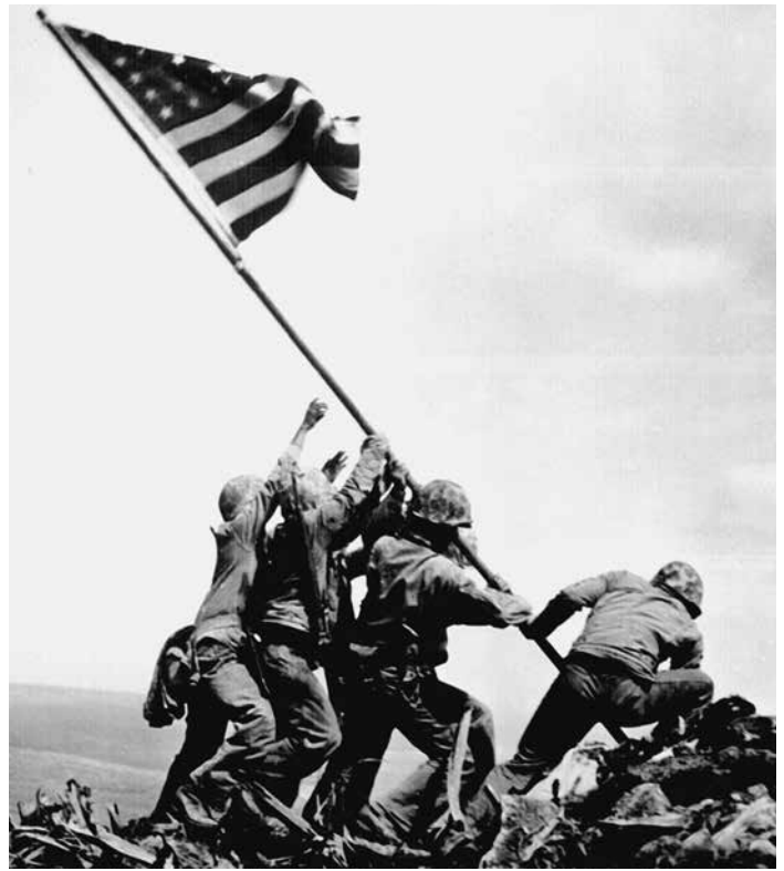
“Raising the Flag on Iwo Jima,”

From 1959 to 1975, United States Armed Forces and the South Vietnamese Army fought against the North Vietnamese in the Vietnam War. The United States supported the democratic government in the south of the country to help it resist pressure from the communist north. The war ended in 1975 with the fall of Saigon, the capital of South Vietnam. In 1976,