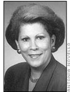
Antonia Coello Novello