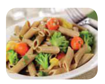
Eat the right amount of calories for you