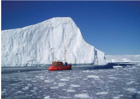
Access to Arctic resources is likely to be affected by climate change including wildlife, fish, and oil