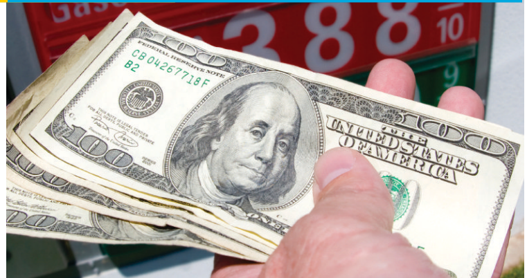
Our gas-saving tips can help you use less fuel and save money.